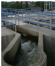
Figure 1 - How to insert a figure

The pictures are used to show key points of the research. You should use them but avoid resolution overkill, more than 150 dpi but less than 300 dpi.